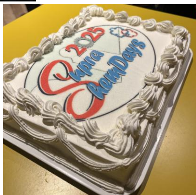
Supra chem Days, 2025