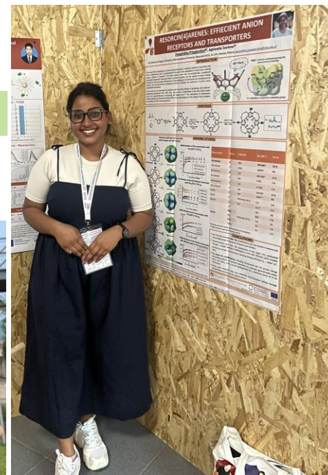
Poster presentation and group photo