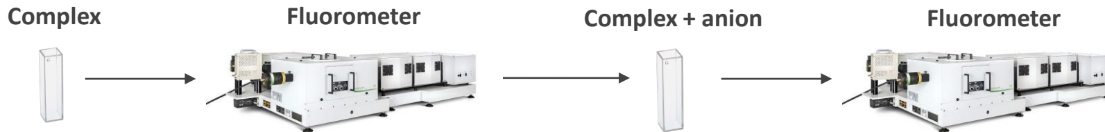
Figure 1: Abbreviated sample measurement procedure.