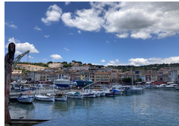
Fig. 1: Center of Cassis

The conference was a great opportunity to present our research on cyclophosphazenes and to network with other scientists.