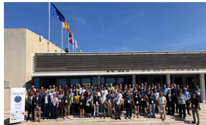
Fig. 4: Photo of all the participants in front of the conference venue