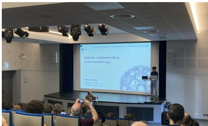
Fig. 2: The beginning of the first plenary lecture given by Prof Makoto Fujita